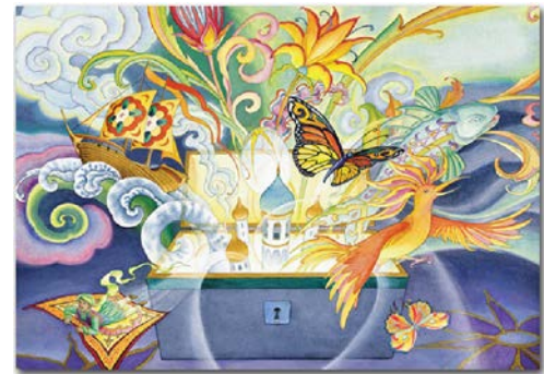
All-Occasion Cards, 1 packet of 10 for $20/pk.

And while you are making this donation, why not purchase some ALL-OCCASION cards to send at any time in the year? EACH CARD WILL PROVIDE A BOOK TO A CHILD.