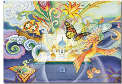
All-Occasion Cards, 1 packet of 10 for $20/pk.

And while you are making this donation, why not purchase some ALL-OCCASION cards to send at any time in the year? EACH CARD WILL PROVIDE A BOOK TO A CHILD.