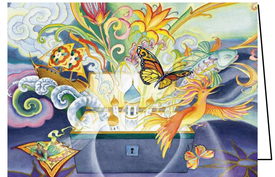
All-Occasion Cards, 1 packet of 10 for $20/pk.

For more information on the ISHK-Hoopoe Books for Afghanistan program, visit: http://booksforafghanistan.org